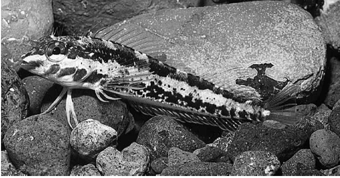
FIG. 3. Malacoctenus sp. (UFRJ 5377) 44.0 mm SL, a new, scaled blenny from Trindade Island.