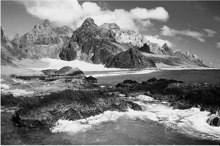
FIG. 2. Volcanic reefs at Trindade Island (20°30'S, 29°20'W), off Brazil.

Filho, 1982). A tropical oceanic climate prevails, ameliorated by eastern and southern trade winds, with mean water temperatures of 27°C (DHN, 1968).