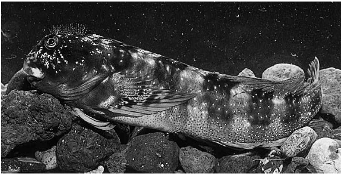
FIG. 4. Scartella sp. (UFRJ 5378) 85.0 mm SL, a new blenny from Trindade Island.