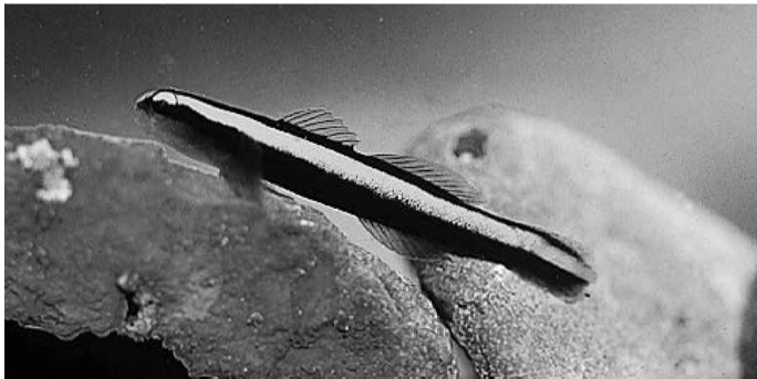
FIG. 5. Elacatinus sp. (UFRJ 5415) 23.3 mm SL, a new cleaner goby from Trindade Island.